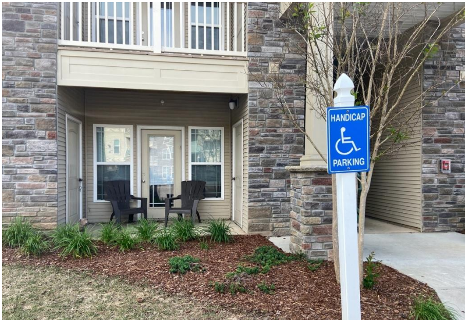
Figure S1: Exterior images of Residence A (a) and Residence B (b).