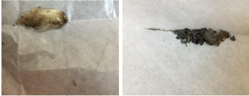
Fig S1. The final residue of PSF waste after treatment in an atmospheric-pressure microwave plasma reactor