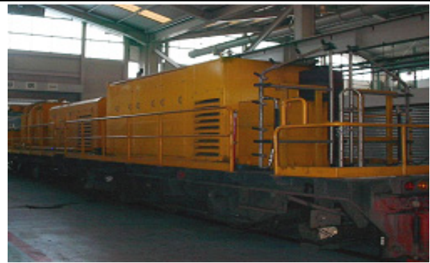
Engineering vehicles RC48-335