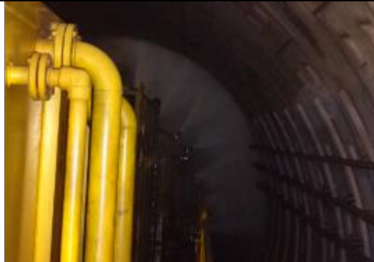
Tunnel cleaning process